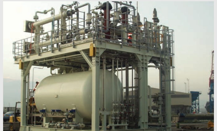
EnCana Buzzard Fuel Gas Conditioning Package (UK, Offshore)