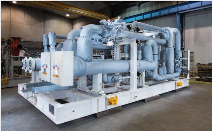
BP Shah Deniz 2 Fuel Gas Treatment Package (Azerbaijan, Offshore)

Our installed systems are conditioning feed gas for all major gas turbine manufacturers including GE, Siemens, Rolls-Royce and ABB.