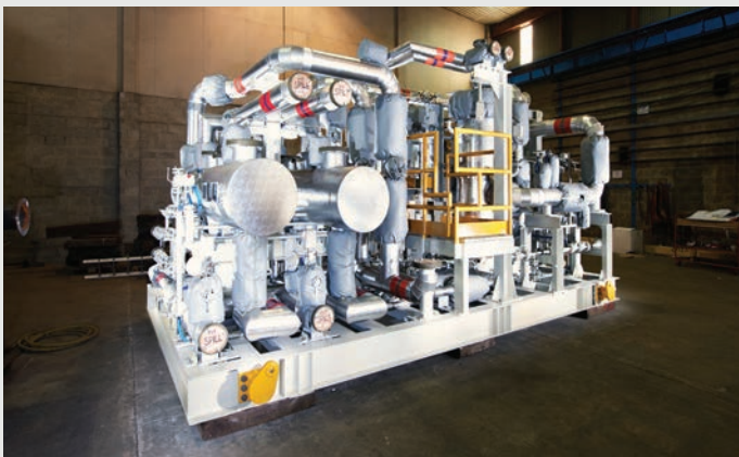
Mellitah Bouri Fuel Gas Treatment Package (Libya, Offshore)