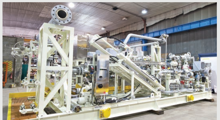
Nexen Petroleum Golden Eagle Oil & Gas Metering (UK Offshore)