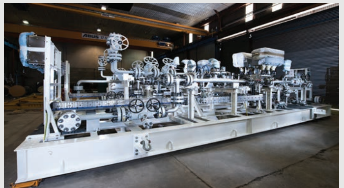
Nexen Petroleum Aoka Mizu Fuel Gas Import Metering System (UK Offshore)