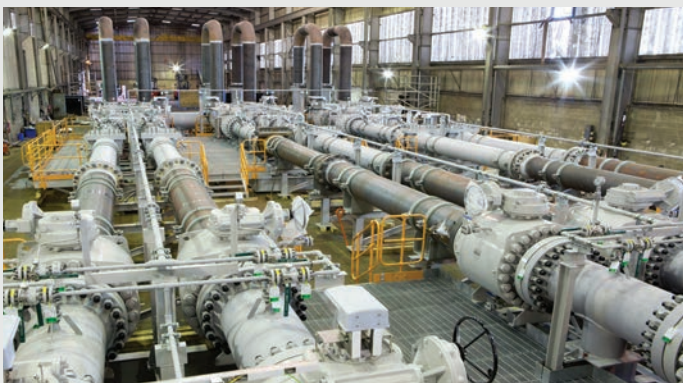
BP South Caucasus Expansion Project (Georgia)