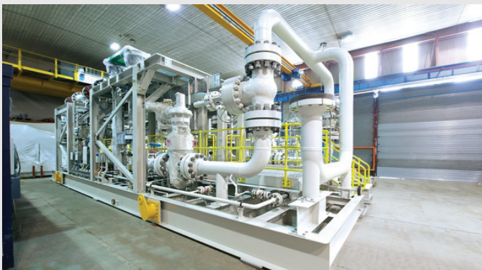
BP Clair Ridge Metering Package (UK Offshore)

We are approved by a wide range of operating companies worldwide which include BP, Shell, Chevron, BG, Saudi Aramco, PDO and ADNOC Group Companies, KOC and KNPC. We are also registered on the FPAL and Achilles databases for the UK (Supply Line) and Norway (JQS).