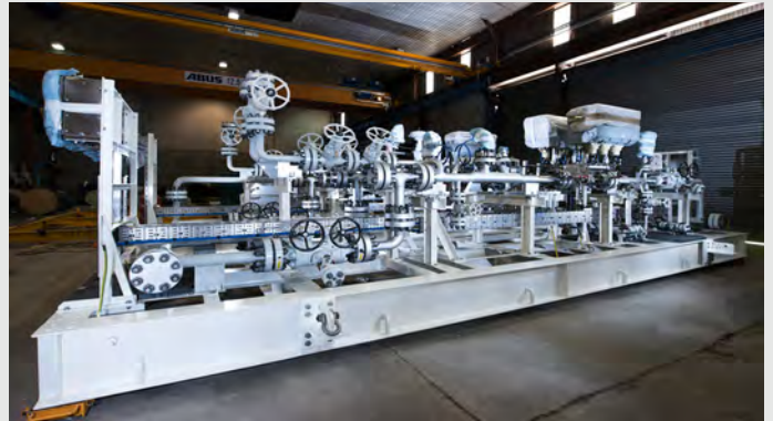
Nexen Petroleum Aoka Mizu Fuel Gas Import Metering System (UK Offshore)