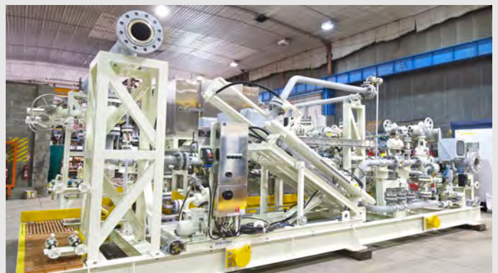
Nexen Petroleum Golden Eagle Oil & Gas Metering (UK Offshore)