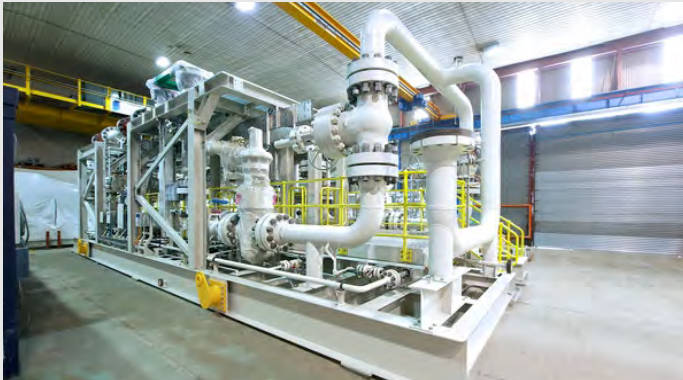
BP Clair Ridge Metering Package (UK Offshore)

We are approved by a wide range of operating companies world-wide which include BP, Shell, Chevron, BG, Saudi Aramco, PDO and ADNOC Group Companies, KOC and KNPC. We are also registered on the FPAL and Achilles databases for the UK (Supply Line) and Norway (JQS).