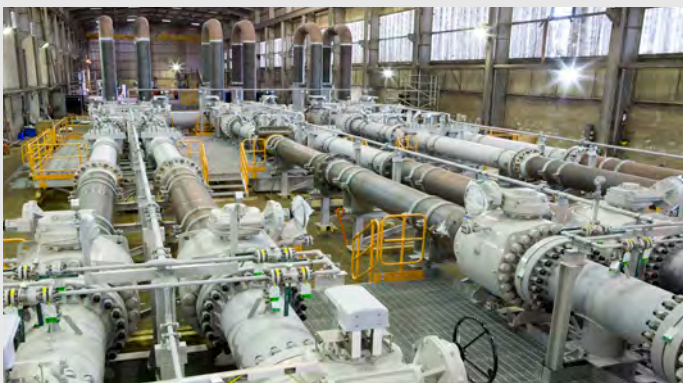
BP South Caucasus Expansion Project (Georgia)